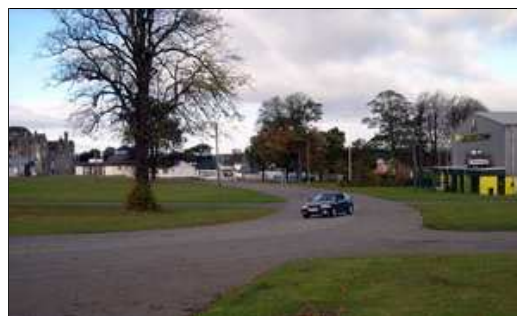
... replicated by my little Honda CRX in 2003!