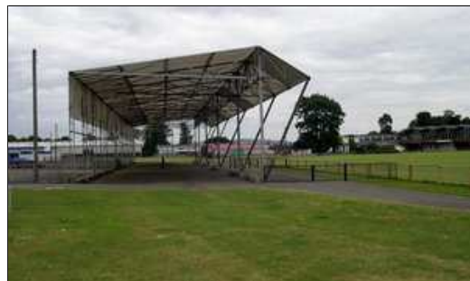
... and in 2005; the original grandstand has been replaced by a new structure which sits right on the old circuit