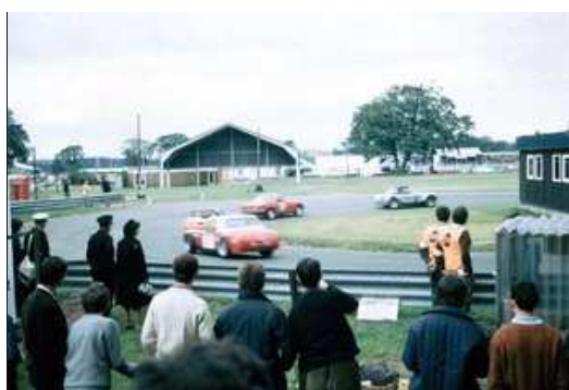
Modsports at the Hairpin in 1970