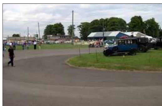
Same view during a car show in 2005

A recent aerial view of Ingliston - the main A8 Edinburgh to Glasgow road is visible cutting across the top right of the photo.