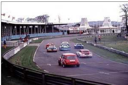
The start line in 1981...