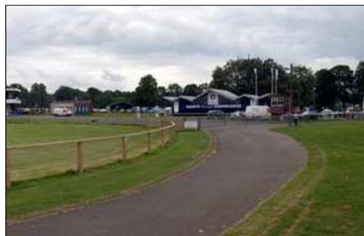
Same view in 2005 - less tarmac and no armco!