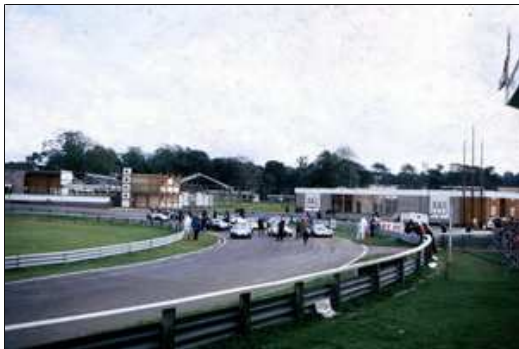
GTs on the dummy grid in 1967

Interestingly, the majority of the track itself still exists, with the exception of the start/finish area, as the following photos illustrate: