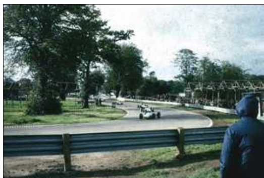
F. Libre cars approaching Caravan in 1966...