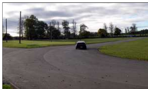
makes my little Honda look rather pathetic at the same spot 24 years later!