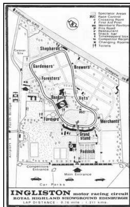
Circuit map 1965-68

September 1968 saw a new section of track opened, finally giving the circuit a decent straight worthy of the name, along with a very tight hairpin bend, initially named West Gate.